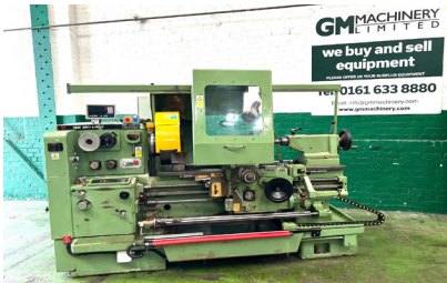
29333 DEAN SMITH & GRACE Type 1910 x 40" (1016mm) Straight Bed Centre Lathe.