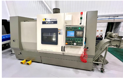
29555 VICTOR Vturn 36/85 CNC Lathe with Fanuc 0i-T Control. Year 2012.