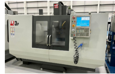
29514 HAAS TM3P Vertical Machining Centre with Haas Control. Year 2012.