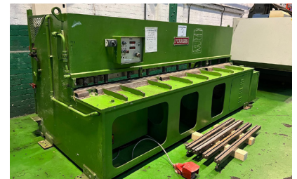
28959 PEARSON 3000mm x 6.5mm Hydraulic Guillotine. Squaring Arm, Work Supports and Powered Back Gauge.