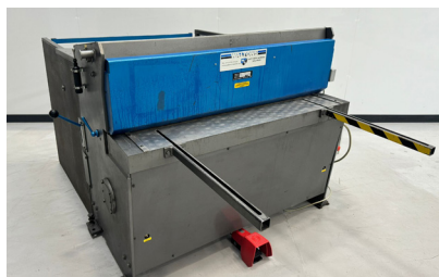
29851 WALTONS PG 1250/2 x 3mm Guillotine. Year 2008.