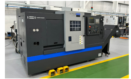
29472 HWACHEON Hi-Tec 200B CNC Lathe with Fanuc Oi-TD Control. Year 2012.