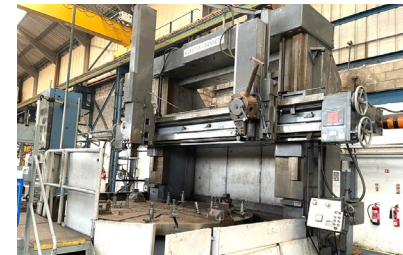
29132 WEBSTER & BENNETT DCM 120" Double Column Vertical Boring Machine with 2 x Newall DP700 Digital Readouts.