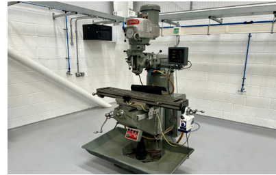
29813 BRIDGEPORT Series 1 Variable Speed Turret Mill with DRO.