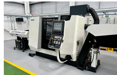
29803 DMG MORI 450 Eco Turn CNC Lathe with Siemens Shopturn Control. C & Y Axis. Year 2016.