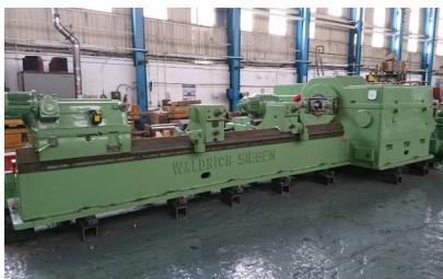
28420 WALDRICH SEIGEN Model WS11a850 Roll Grinding Machine. Swing 1100mm x 3500mm.