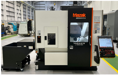
29773 MAZAK Variaxis J-500/5X Axis Vertical Machining Centre with Mazatrol Smooth X Control. Year 2019.