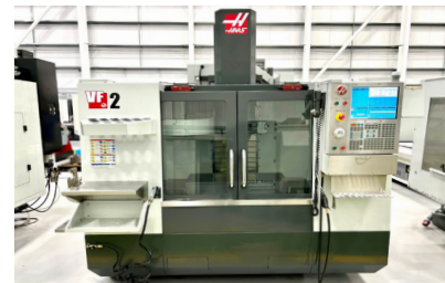
29661 HAAS VF2 Vertical Machining Centre with 4th Axis Attachment. Year 2015.