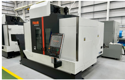
29788 MAZAK VCN 530C Vertical Machining Centre with Smooth Control. 18k Spindle. c/w Ultraspindle Attachment. Year 2022.