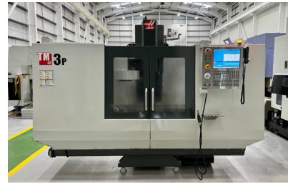
29478 HAAS TM3P Vertical Machining Centre with Haas Control. Year 2015.