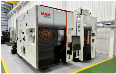
29418 MAZAK VARIAXIS i300 AWC Vertical Machining Centre with Smooth Control. New 2018. Installed 2019.