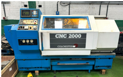
29463 COLCHESTER 2000 CNC Flat Bed Lathe with Fanuc O-T Control. Year 1992.