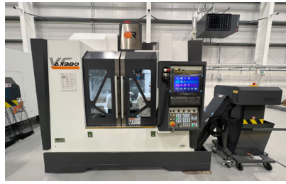
10026 NEW VICTOR AX380 5 Axis Vertical Machining Centre.