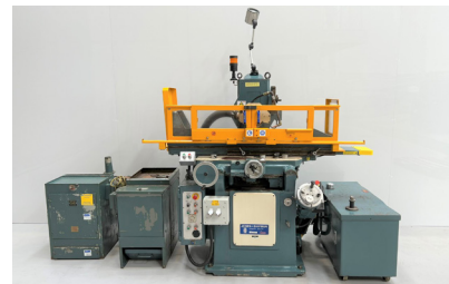
28907 JONES & SHIPMAN 1400P Hydraulic Surface Grinder. Year 1980.