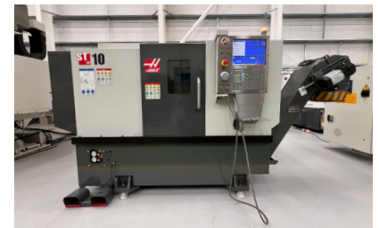
29800 HAAS ST10 CNC Lathe with Haas Control. Year 2017.