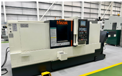
29780 MAZAK Quick Turn Smart 200M CNC Lathe with Live Tooling & Hydrafeed Multifeed Barfeed. Year 2015.