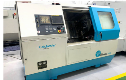
29464 COLCHESTER Tornado 220M CNC Lathe with Fanuc 21i-TB Control. Year 2003.