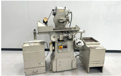
29492 JONES & SHIPMAN 540P Hydraulic Surface Grinder with Magnetic Chuck.