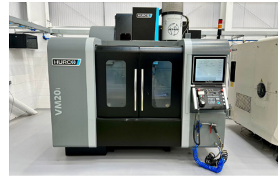
29804 HURCO VM20i Vertical Machining Centre with Max Control. Year 2017.