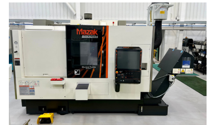
29801 MAZAK Quickturn 200MY CNC Lathe with Smooth Control. C & Y Axis. Year 2019.