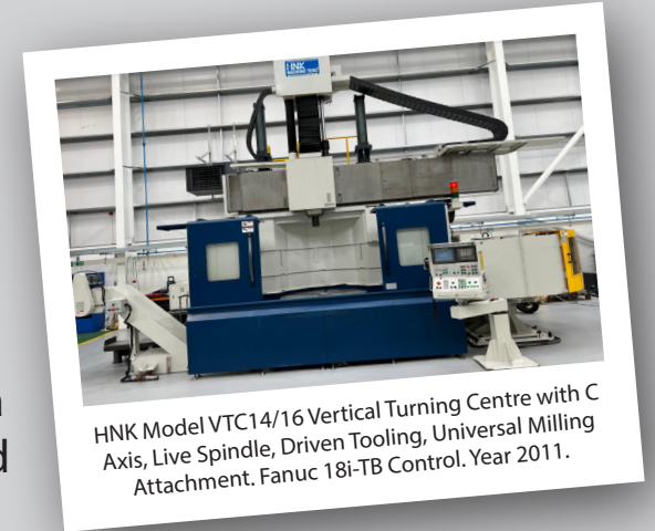
HNK Model VTC14/16 Vertical Turning Centre with C Axis, Live Spindle, Driven Tooling, Universal Milling Attachment. Fanuc 18i-TB Control. Year 2011.

We have extensive parking and office facilities. Our headquarters are located in Oldham, Greater Manchester in the North West of England.