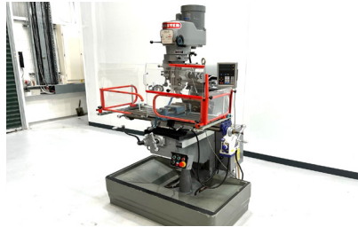
29368 CHESTER Turret Mill with Newall DRO. Year 2002.