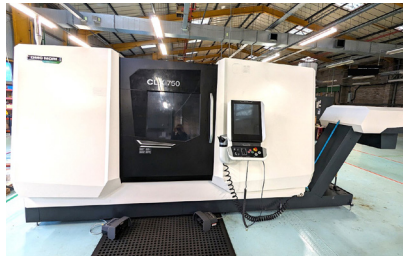
29646 DMG MORI CLX 750 V4 CNC Lathe with Driven Tooling. C & Y Axis. Siemens 840D Control. Year 2021.