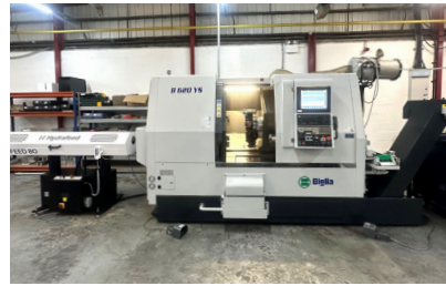
29785 BIGLIA Model B620 YS CNC Lathe with C Axes, Y Axis and Sub Spindle. Fanuc Oi-TF Control. Year 2021.