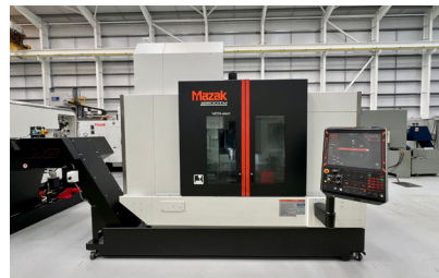
29787 MAZAK VCN 530C Vertical Machining Centre with Smooth Control. 18k spindle. c/w Ultraspindle attachment. Year 2022.