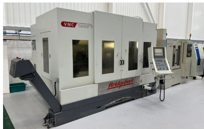
29378 HARDINGE BRIDGEPORT 1500 XP3 Vertical Machining Centre with Heidenhain iTNC 530 Control. Year 2004.