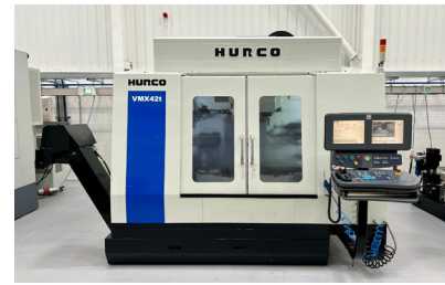
29863 HURCO VMX42T Vertical Machining Centre with WinMAX Control. Year 2010