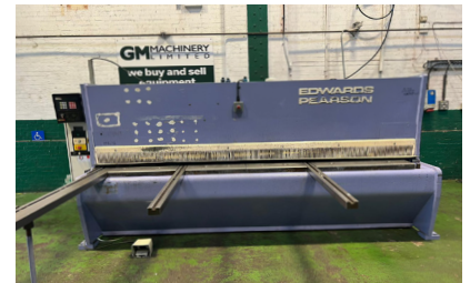
29449 EDWARDS PEARSON Model VE10/3000 Hydraulic Guillotine with Swissax 2000 NC Backgauge. Year 1993.