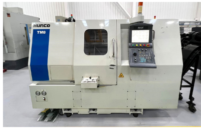
29483 HURCO TM8 CNC Lathe with MAX Control. Year 2008.