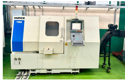
29484 HURCO TM8 CNC Lathe with MAX Control. Year 2005.