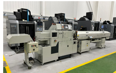
29296 CITIZEN B12 Sliding Head CNC Lathe with IMECA Mini Boss 325CNC Barfeed. Year 1997.