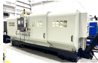
29553 SFM Model CET28120 CNC Flat Bed Lathe with Fanuc Oi-TD Control. Year 2014.