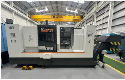
10039 NEW VICTOR S26/110 CNC Lathe with Fanuc Oi-TF Control.