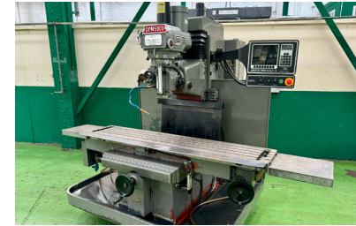
29517 XYZ DPM5000 CNC Bedmill with ProtoTrak AGE3 Control. Year 2000.