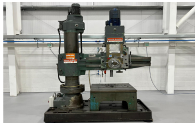
29262 ASQUITH-ARCHDALE Model 2PT 12-54 4'6" Radial Arm Drilling Machine with Box Table. Year 1972.