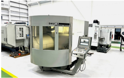
29775 DECKEL Maho 60T Vertical Machining Centre with Heidenhain iTNC530 Control. Year 2003.