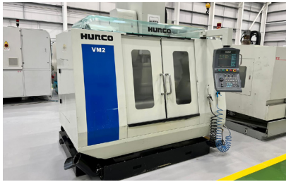
29480 HURCO VM2 Vertical Machining Centre with Nikken CNC202YA 4th Axis Attachment. Year 2006.