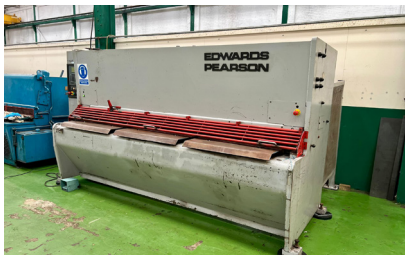
29557 EDWARDS PEARSON Model V13/3000 Hydraulic Guillotine with Cybeclec DNC60 NC Backgauge.