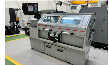
29850 XYZ SLX 355 x 1000mm CNC Lathe with Prototrak Control. Year 2010.