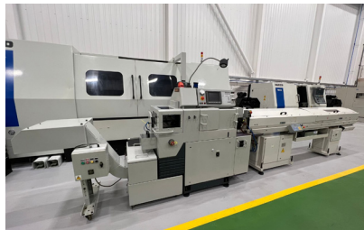
29295 CITIZEN B12 Sliding Head CNC Lathe with IMECA Mini Boss 325CNC Barfeed. Year 1995.