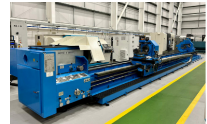
28729 BINNS & BERRY Trident L850 Straight Bed Centre Lathe x 12,000mm Between Centres. Rebuilt 2008.