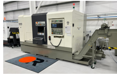
10008 NEW VICTOR A20YCM CNC Lathe with Y axis and Driven Tooling. Fanuc Oi-TF Control.