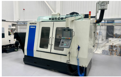
29805 HURCO VMX42 Vertical Machining Centre with Max Control. Year 2006.