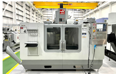
29662 HAAS VF4 Vertical Machining Centre. Year 2006.