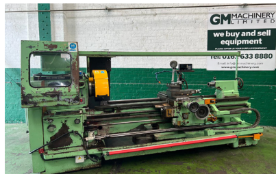
29334 DEAN SMITH & GRACE Type 1910 x 80" (2032mm) Gap Bed Centre Lathe.