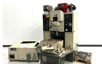
29556 SYKES V400 Gear Shaper with Change Gears.