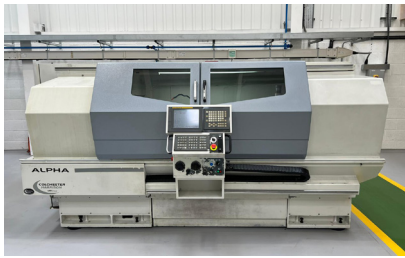
29364 HARRISON Alpha 1460XS CNC Lathe with Fanuc Oi-TD Control. Year 2013.