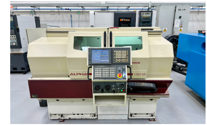
29796 HARRISON Alpha1350XS CNC Gap Bed Lathe with Fanuc 21i-TB with Manual Guide. Year 2006.