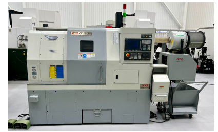
29862 XYZ CT52 LTY CNC Lathe with Y Axis & Driven Tooling. Siemens Sinumerik 828D Control. Year 2015.