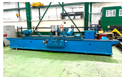
29858 CHURCHILL CW Plain Cylindrical Grinder. Swing 13" x 120" Between Centres.