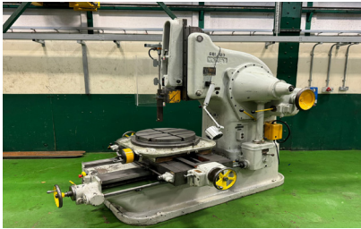
29860 MOREY (USA) 12" Slotting Machine with 24" dia Rotary Table.