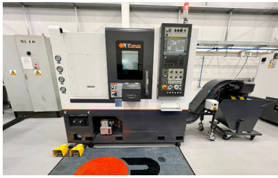
10044 NEW VICTOR NP20CM CNC Lathe with Driven Tooling, Large Spindle Bore and Fanuc Oi-TF Control.