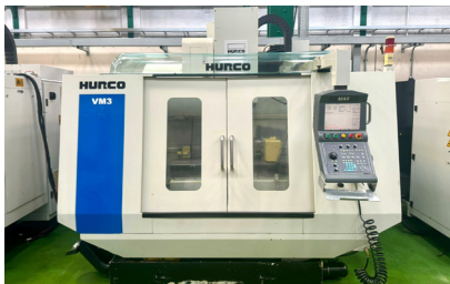
29467 HURCO VM3 Vertical Machining Centre with WinMAX Control. 4th Axis. Year 2005.