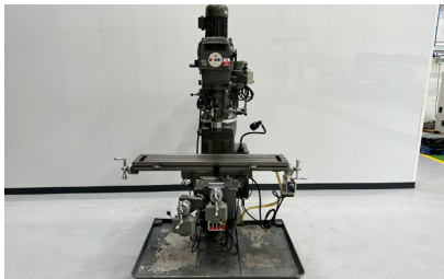
29370 AJAX Model AJT1 Turret Milling Machine.