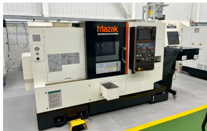
29802 MAZAK Quick Turn 250MY CNC Lathe with Nexus Control. C & Y Axis. Year 2011.