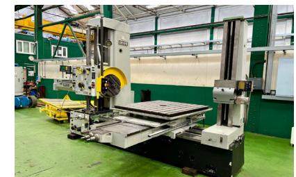
29861 UNION BFT80/2 Table Type Horizontal Borer with Outer Steady & DRO.

Please feel free to discuss with us any finance requirements you may have. Part exchange machines welcome. Please ask about our low cost finance and rental options.