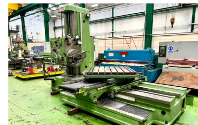
29806 TOS W100A Table Type Horizontal Borer with Acu-rite 3 Axis Digital Readout. Year 1998.