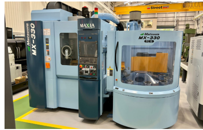
29417 MATSUURA MX-330 10 Pallet 5 Axis Vertical Machining Centre with Matsuura G-Tech 31i Touch Screen Control. Installed 2022.