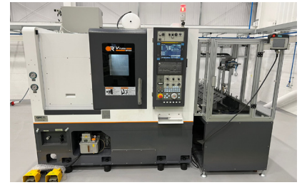
10028 NEW VICTOR NP20CM CNC Lathe with Driven Tooling and Fanuc Oi-TF Control.