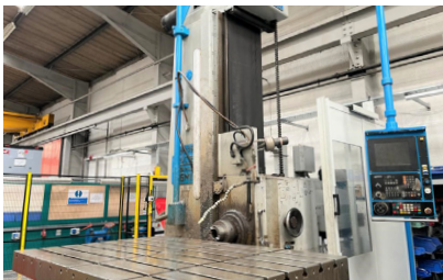
29380 HERBERT DEVLIEG 54-K-96 CNC Jigmill with Heidenhain TNC131 Control.