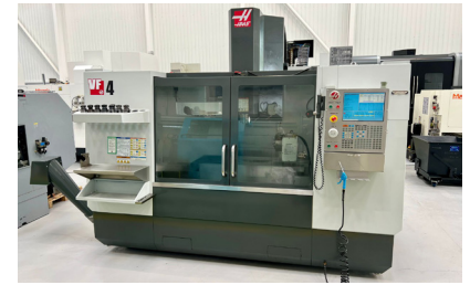
29791 HAAS VF4 Vertical Machining Centre with 4th Axis Attachment. Year 2010.